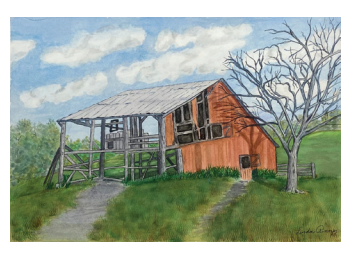
Third Place Linda Pinney Fixer Upper Watercolor | NFS

Second Place Gretchen Cave Through the Woods Watercolor | NFS