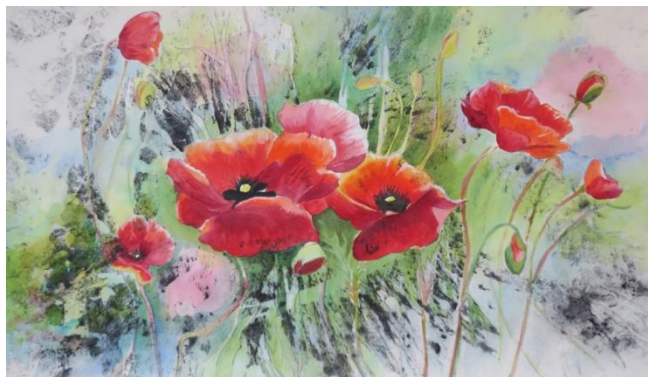
Poppy Field, charcoal wash & acrylic by Donna Arnold WSI

The workshop will be "Charcoal Wash with Acrylic" and the focus will be creating a dynamic background with charcoal powder and water and then building into that beginning.